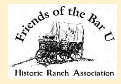
Page 10 of 10